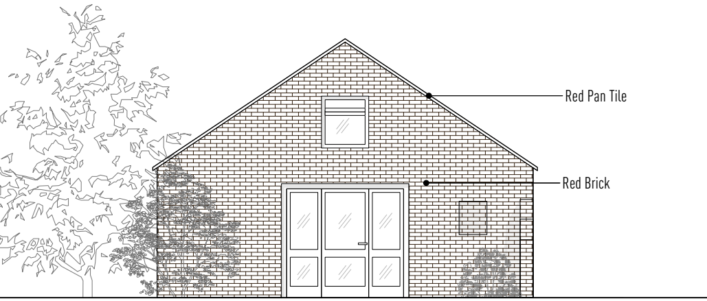
04 - Existing West Elevation 1:100 @A3